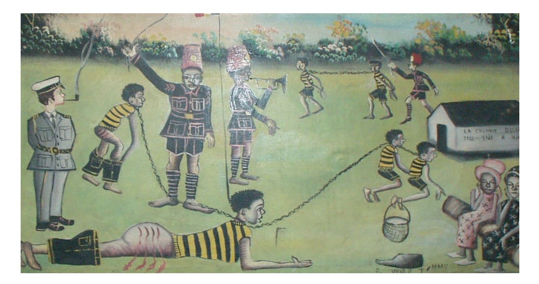
Photo 2: "La colonie belge 1885–1960". Oil painting by E. Nkulu – [no date – MRAC Histoire A, 3913]. Exhibition in: "La mémoire du Congo". Le temps colonial. Musée Royal de l'Afrique Centrale, Tervuren.

All the different museographic strategies have in common their focus on material culture and aesthetics. However, as regards the representations of 'other' cultures, whether these are of aliens or of minorities, both indigenous and foreign, there has been during the last ten years or so a clear polarization between the narrative contextual perspective and the aesthetic one. Aesthetics in the sense of principles concerned with artistic taste and the pursuit of beauty and its use as a tool of cognition and knowledge is becoming the favoured method of display in a number of museums of cultural history in Western Europe. The example of France where in the 1990s decisions were taken at the highest political